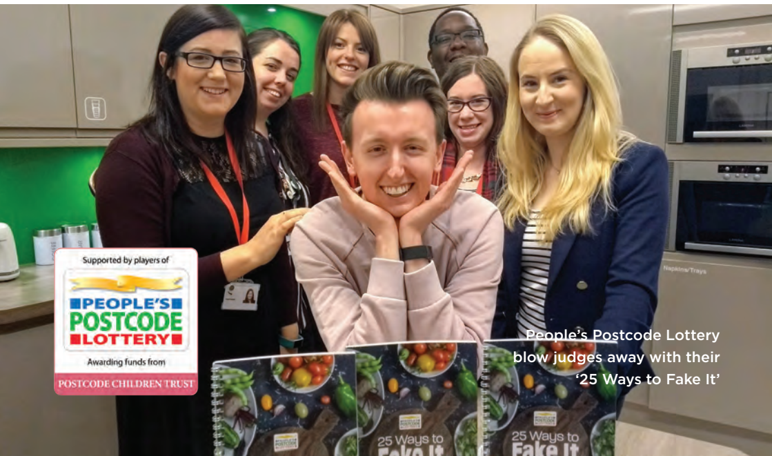
People's Postcode Lottery blow judges away with their '25 Ways to Fake It'

To find out more visit: www.children1st.org.uk/dragons-glen